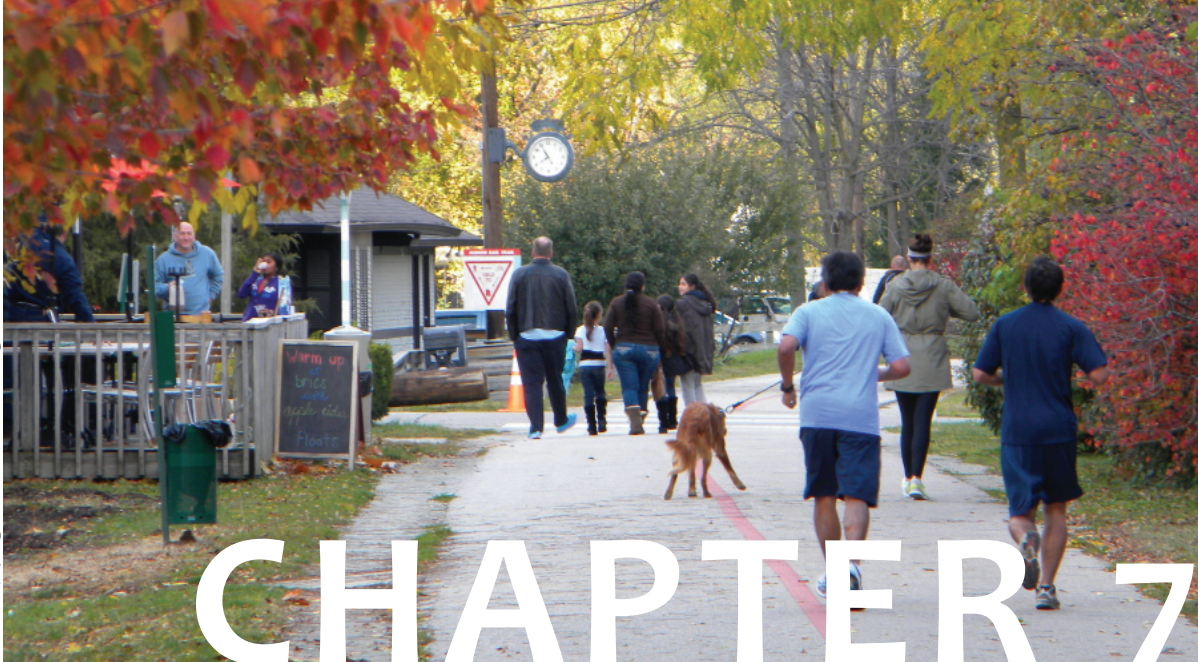
Users enjoying the fall season along the Monon Trail.